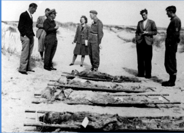
Operation Freshman Norway